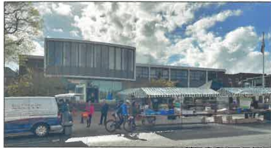
The Artisan Market - it's good to have market traders outside the Town Hall and to get the buzz back into the town

So far, so good with the Artisan Market!